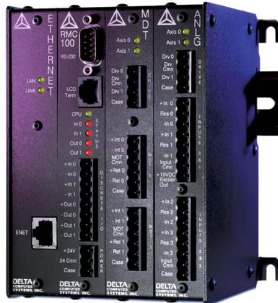
Figure 2. Typical Motion Controller